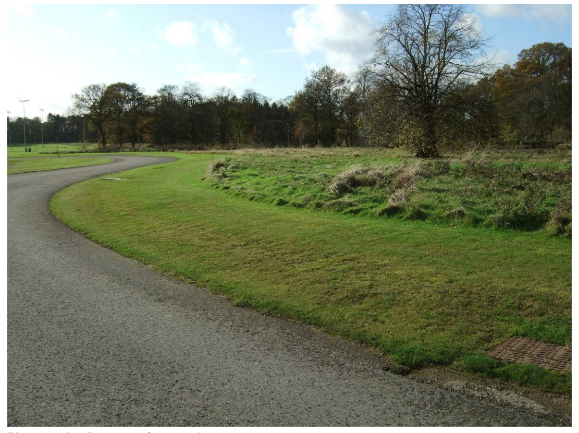
Photograph 4 Panorama from north west corner