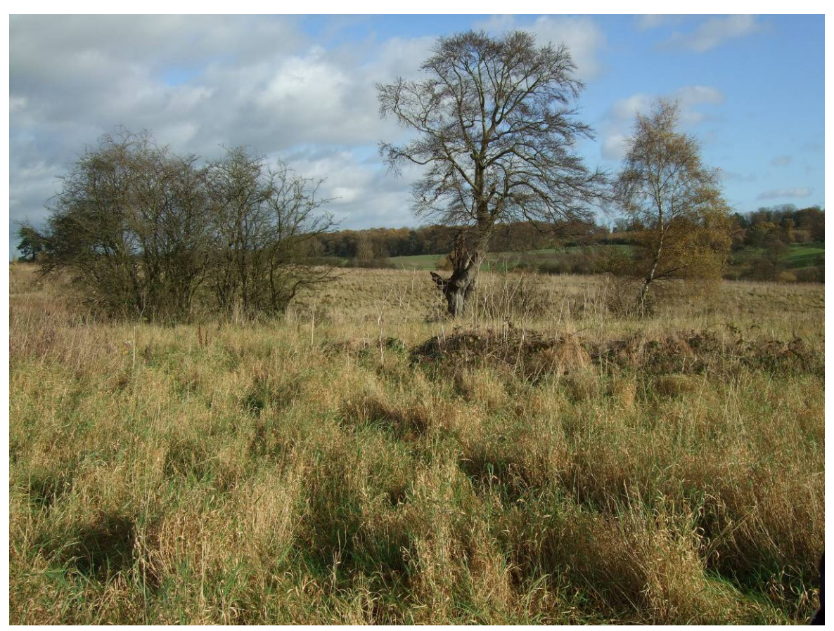
Photograph 17 View north across central part of site