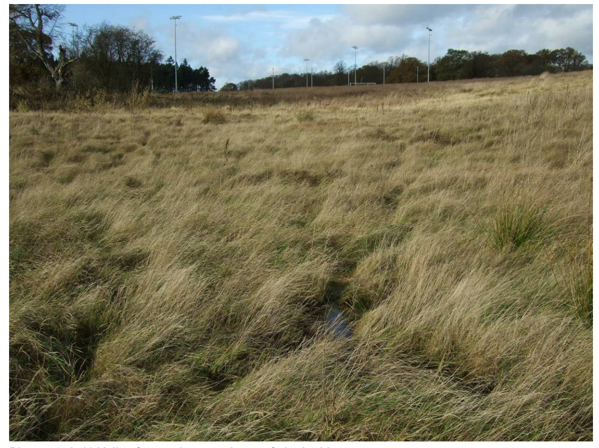
Photograph 18 Valley feature in central part of site looking west