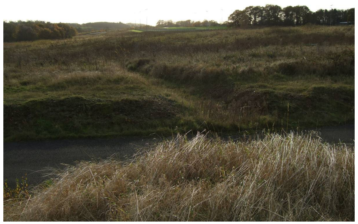
Photograph 11 Panorama looking south across central area of the site