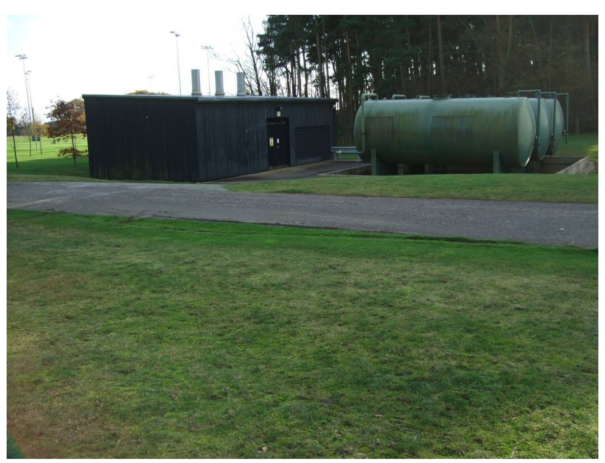
Photograph 15 Underpitch heating building and fuel tanks to west of site