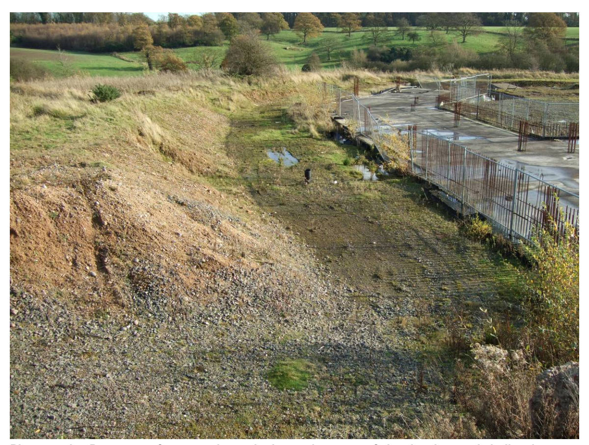
Photograph 7 Panorama of eastern plateau in the northern part of site showing partly built scheme