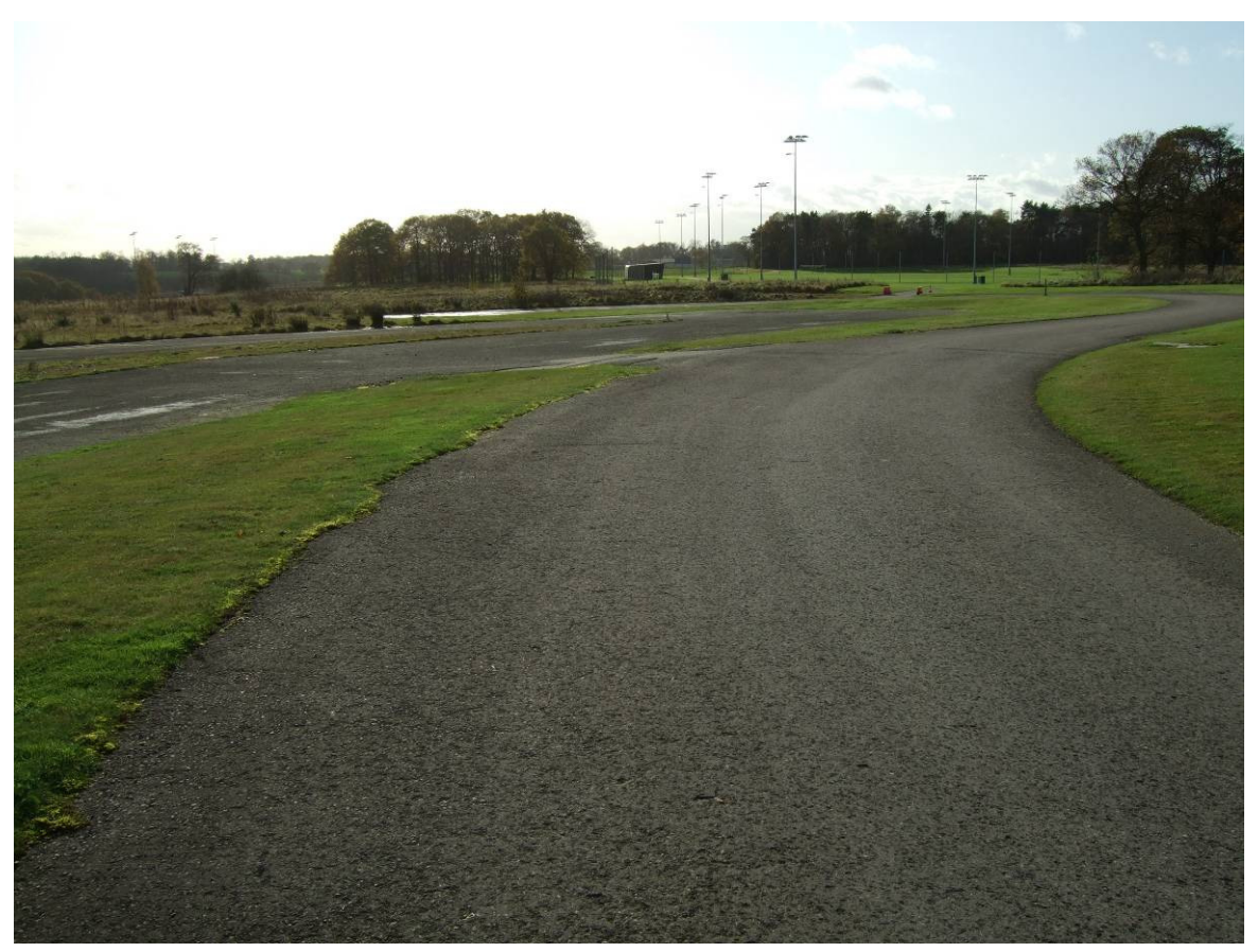
Photograph 3 Panorama from north west corner