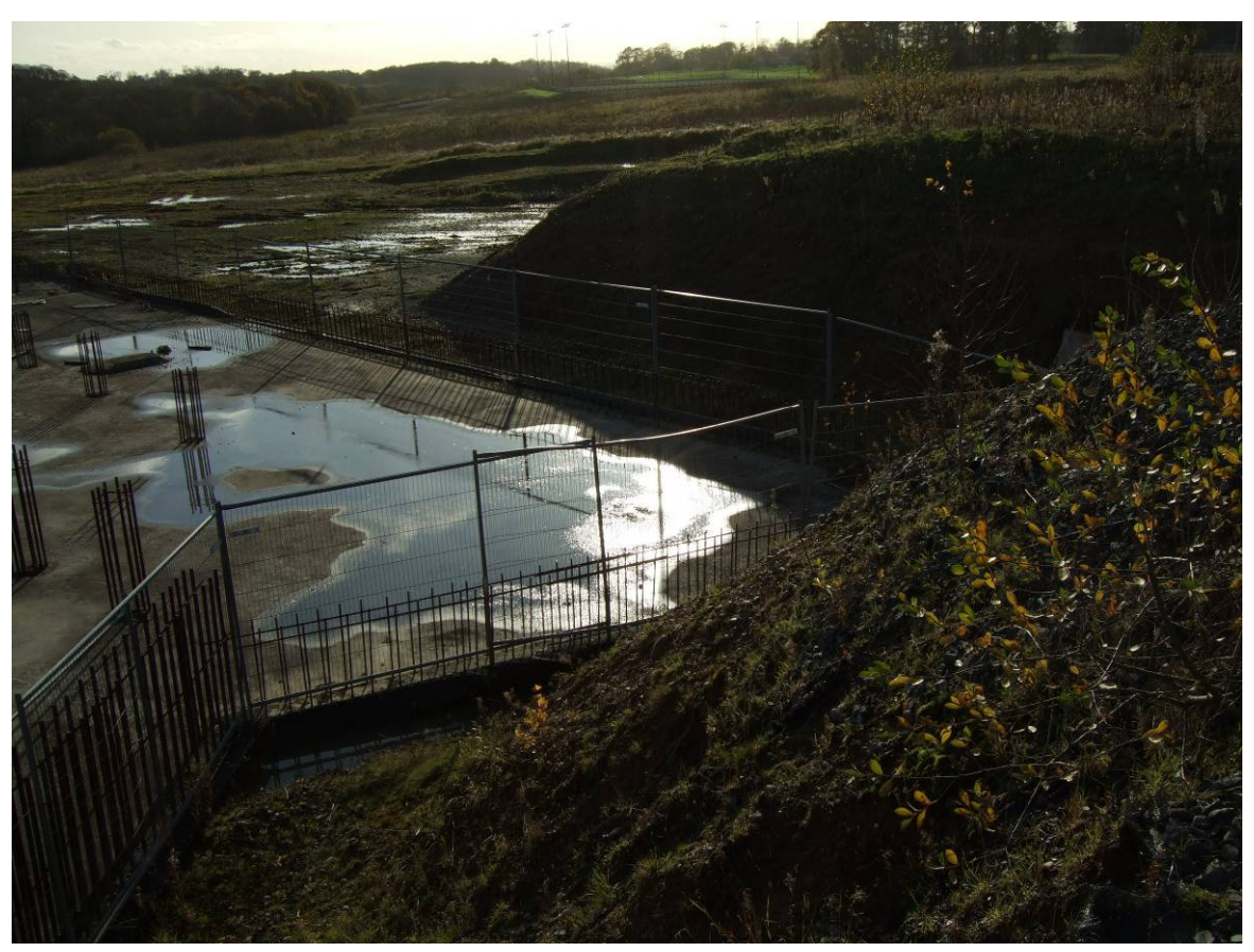
Photograph 9 Panorama of eastern plateau in the northern part of site showing partly built scheme