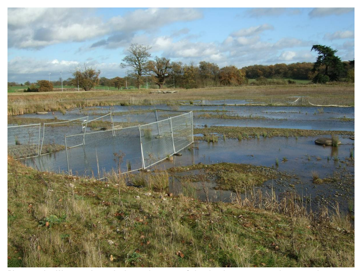
Photograph 5 Western plateau in the northern part of site showing great crested newt pond