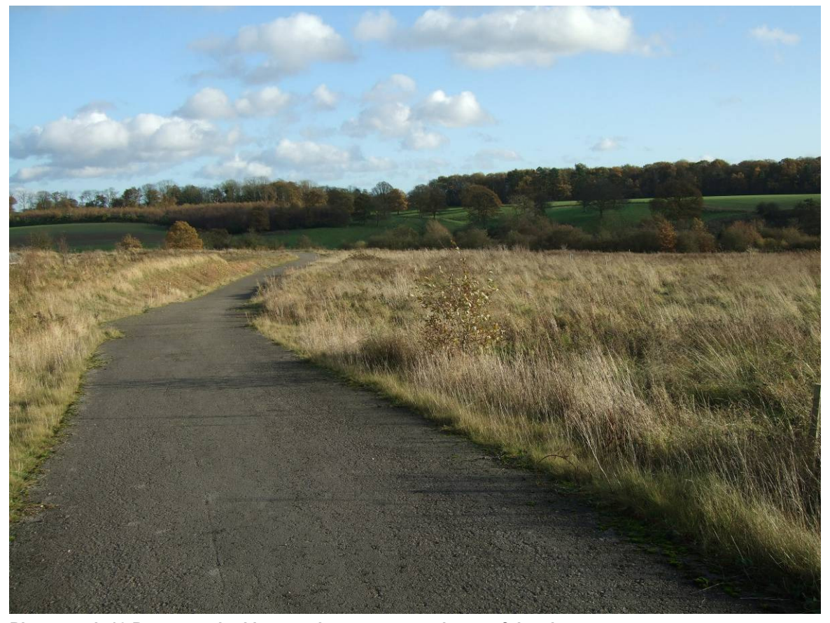
Photograph 10 Panorama looking south across central area of the site