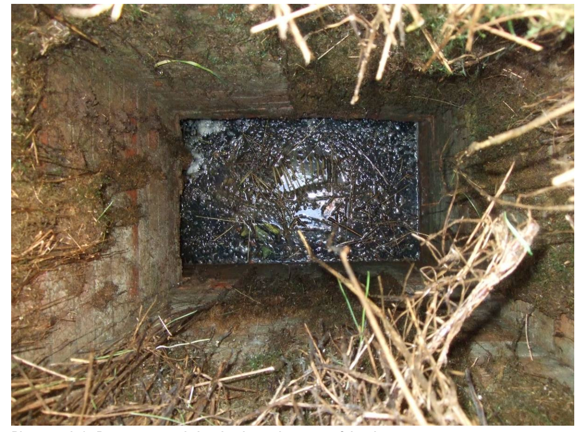
Photograph 14 Deep uncovered chamber in northern part of the site