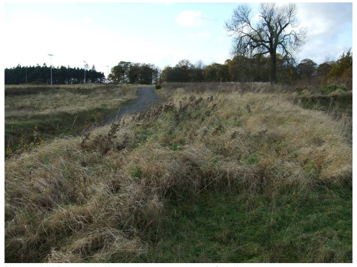
Photograph 12 Panorama looking south across central area of the site