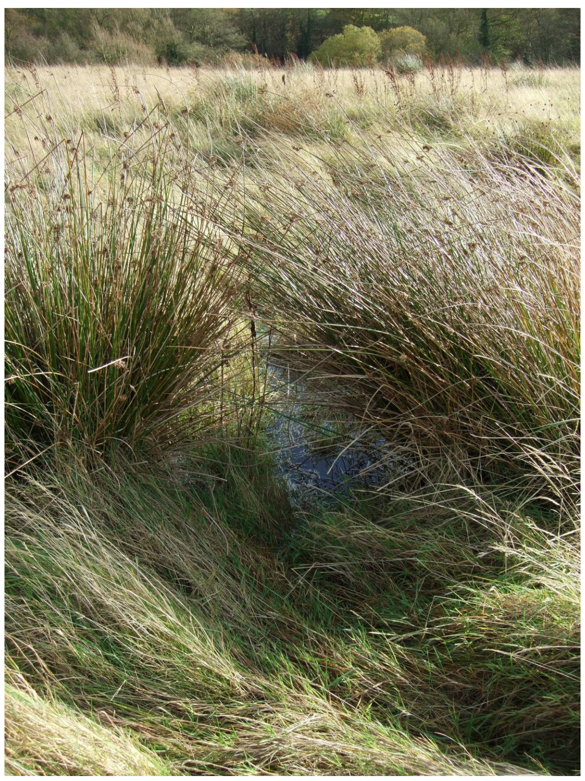
Photograph 19 Area of boggy ground in eastern part of valley feature