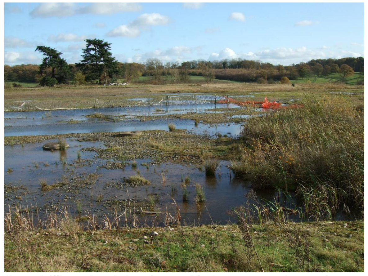
Photograph 6 Western plateau in the northern part of site showing great crested newt pond